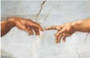
God is In Control

Luke 8:23+ But as they were sailing along He fell asleep; and a fierce gale of wind descended on the lake, and they began to be swamped and to be in danger.